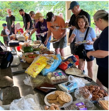
We kicked off the new school year with lots of great food and friends at the Seminary's Back to School Picnic.