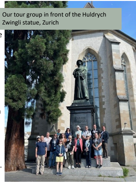
Our tour group in front of the Huldrych Zwingli statue, Zurich

We also visited the monastery in Erfurt in which Martin Luther suffered spiritually, not understanding how God could forgive such a great sinner as he. Erfurt is also known for a famous