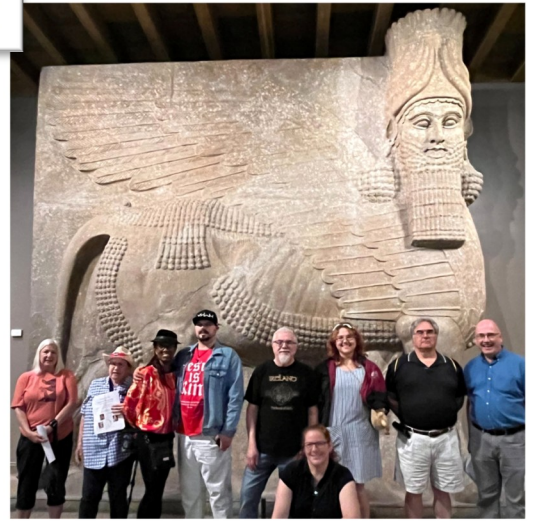
Ancient Israel in Chicago, our annual pilgrimage to the Institute for the Study of Ancient Cultures at the University of Chicago made the Bible come alive.