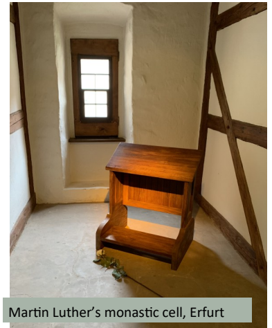
Martin Luther's monastic cell, Erfurt