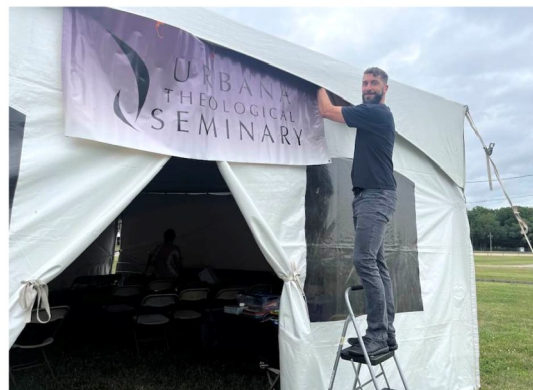
Our Urbana Seminary tent played host to many speakers and activities throughout the AudioFeed Festival at the Champaign County Fairgrounds.