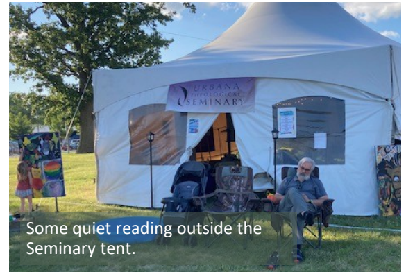
Some quiet reading outside the Seminary tent.