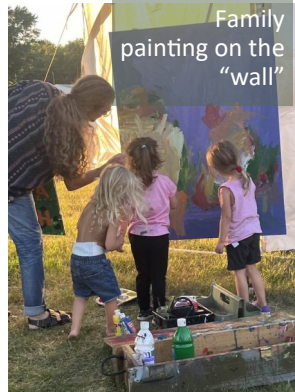
Family painting on the "wall"