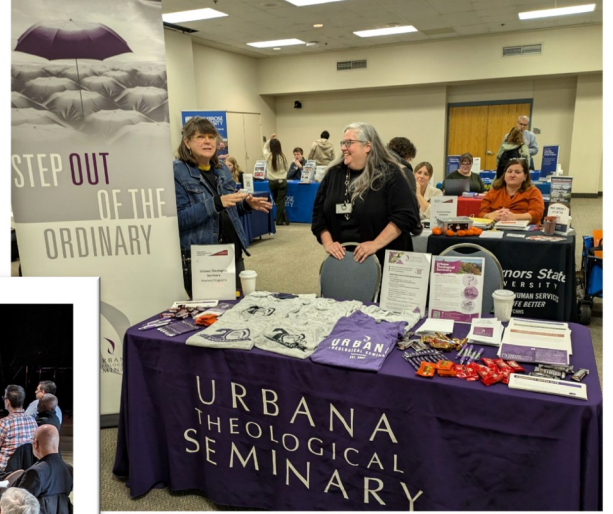
Urbana Seminary ran information tables this year at several places. This picture is from the Graduate and Professional School Fair at Bradley University.