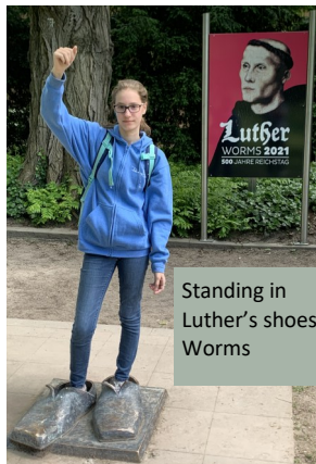
Standing in Luther's shoes, Worms