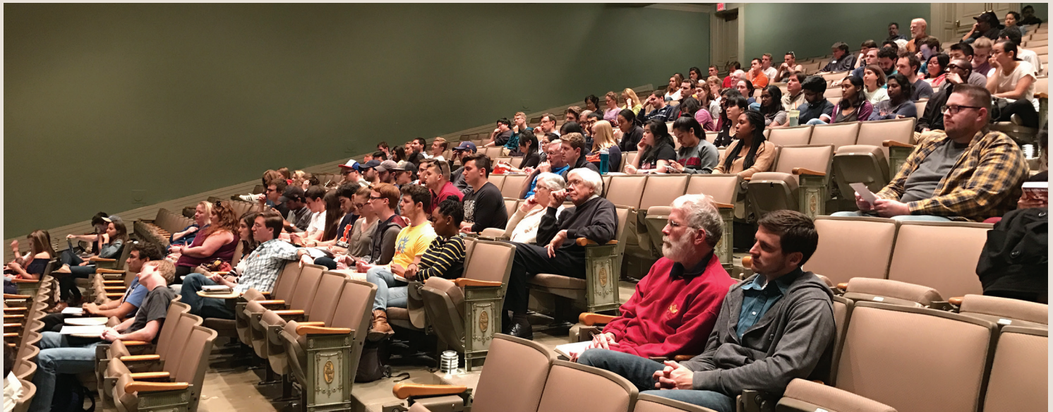
Some of the people who came to Veritas Forum