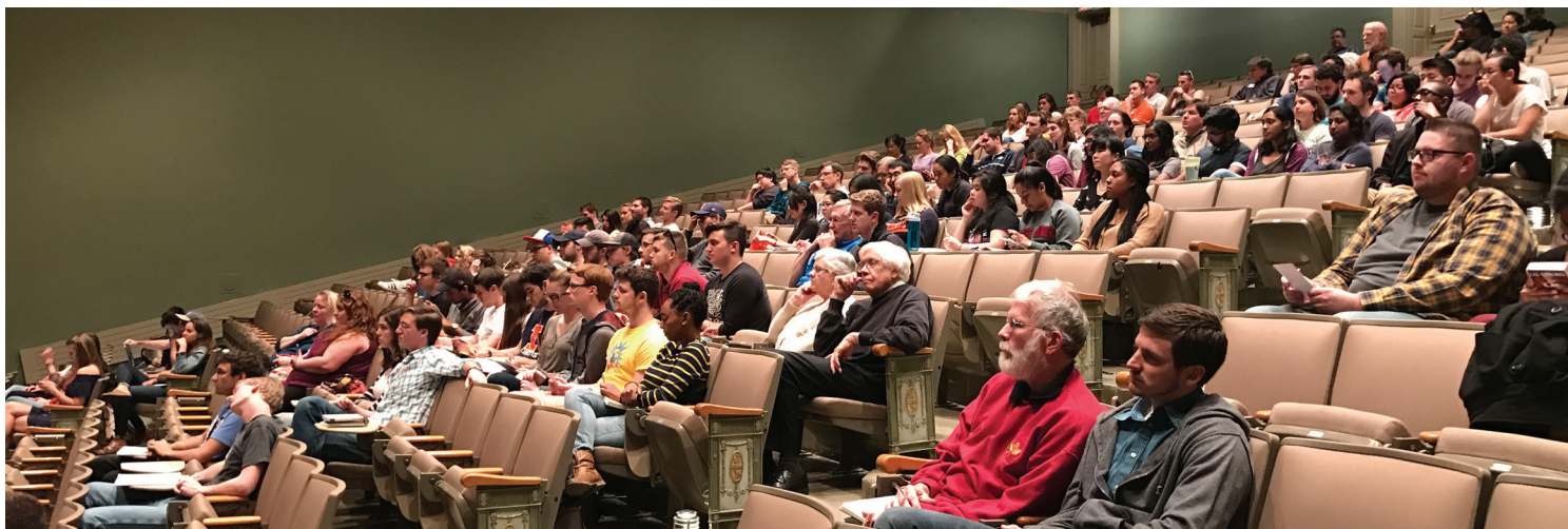
Some of the people who came to Veritas Forum