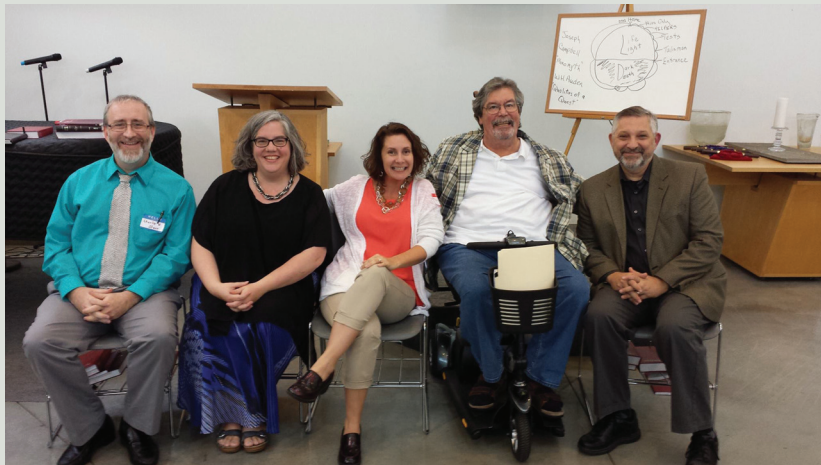
Tolkien Conference Speakers