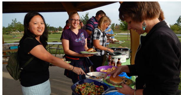
Welcome Back Picnic

The Seminary's fall semester students, teachers, and classes hit the ground running. Courses began the last week of August, following a beautiful evening at the Welcome Back Picnic. We welcomed our incoming class at New Student Orientation on September 6th. Yet once again the quality of the students God sends to us is impressive. Our Introduction to Graduate Research Methods was taught on one Saturday each in September and October.