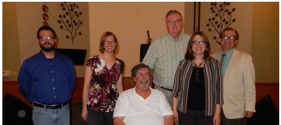
Tolkien Conference Speakers