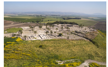
Tel Megiddo, Israel

ministry of Jesus around (and even on) the Sea of Galilee in the north, and the early years of the church in Jerusalem and then spreading outwards towards the ends of the earth. We see all these overlapping layers of the history of God at work, delve into the rich fruit of archaeological digs that illumine the Biblical text, and then relate all of this back to the dimensions of space (geography) and time (history). Using the specially designed maps and timeline that each traveler receives, you will gain a powerful discipleship tool for reading the Bible with genuine understanding. Tutku has not yet produced a fancy brochure for this trip, but if you're interested, the Office will also be delighted to send you a description of where we will go and our itinerary. This gives a good sense of how you'll grow as you see the Land.