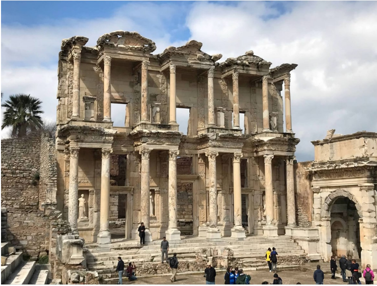
Library of Celsus, Ephesus

Urbana Seminary's Training through Travel ministry is ready for its third overseas educational opportunity. After Israel 2018 and Reformation 2019, how are we looking to the future? First, we are shifting our plans, and wanted you to know. The Israel trip planned for March 2020 has been rescheduled (see below). This means another incredible chance to learn through travel is coming up first.